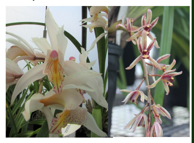
Cym. Frosty Jack 'Fair Orchids' (mastersii x erythrostylum)

There are some primary hybrids around, though most are rarely seen: